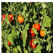
Plate de Haiti Tomato: All tomatoes benefit from staking; indeterminate varieties require it. Prune tomatoes when they reach about 24" high and are starting to produce small suckers.

Ping Tung Long Eggplant: Ping Tung eggplant (also spelled Pingtung) is an heirloom plant originating from Ping Tung, Taiwan. The 2- to 4-foot